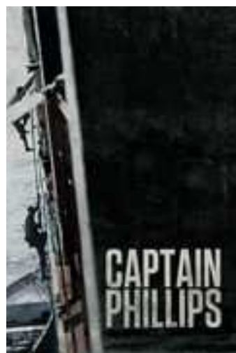
Captain Phillips ★★★