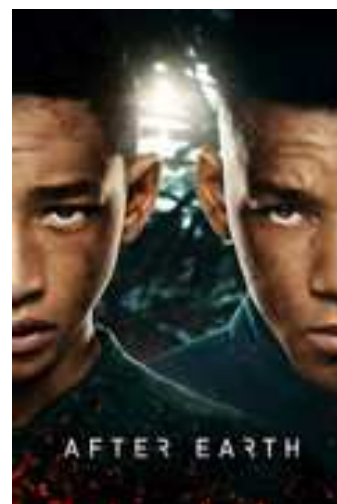
After Earth ★★★★☆