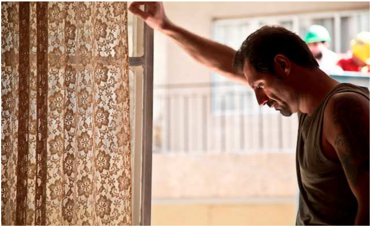
Tony Hanna (Adel Karam) in 'The Insult'